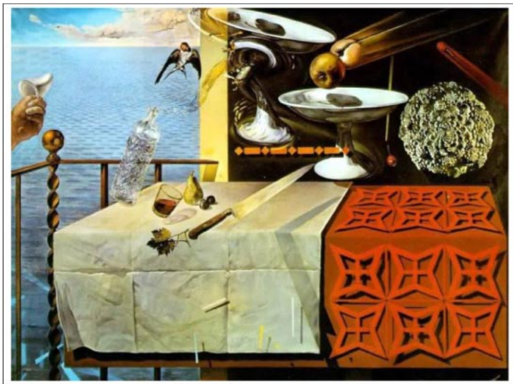
Nature Morte Vivante (Still Life - Fast Moving)

Fig. 2. The challenge of integrating diverse disciplinary perspectives is to retain the precision of diverse elements of the whole to create an overarching picture. The results may seem strange, unrealistic, and surprising, but they allow for novel approaches and new questions to arise. The painting is Nature Morte Vivante (Still Life Moving Fast) by Salvador Dali, 1956, 125x160 cm. The original is in the Salvador Dali Museum, St. Petersburg, Florida, USA.